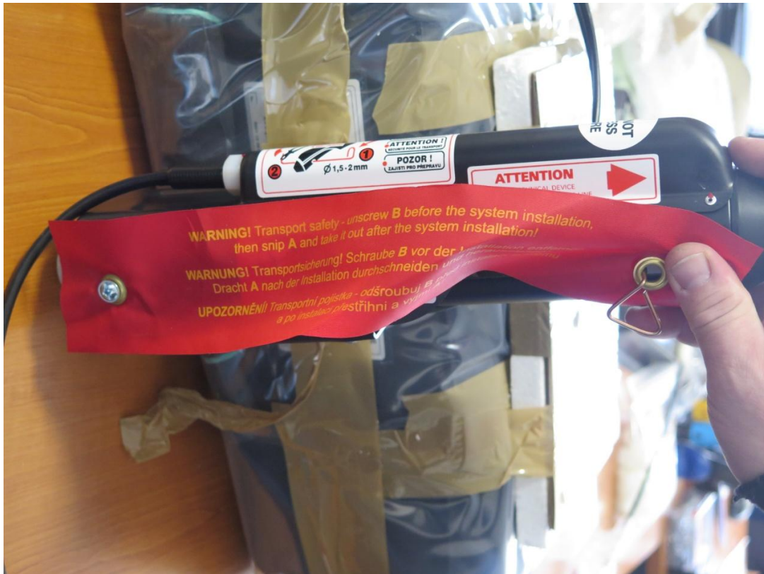
Both fuses have to be removed