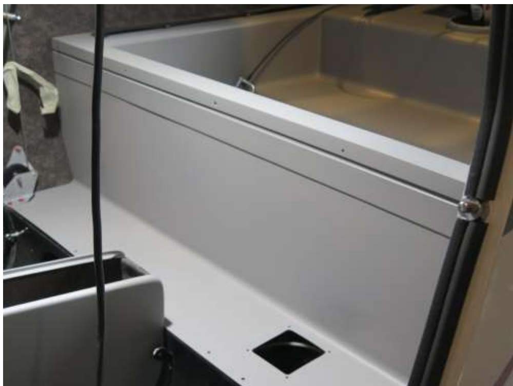
Remove the cover.