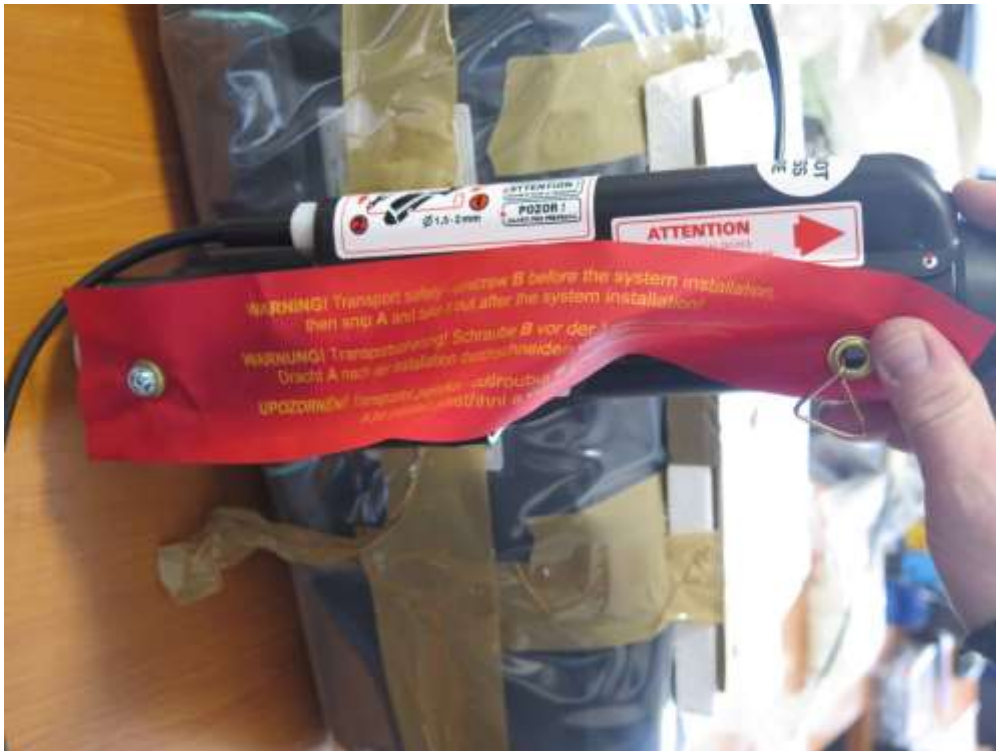
Both fuses have to be removed.